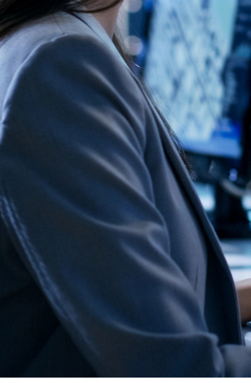
idea to test it in the new environment before fully rolling out Windows 11 across all devices. This way, you can avoid any unexpected downtime or disruptions.

For businesses using specialized or custom software, there may be a need to consult with your IT team or vendor to ensure everything integrates properly with Windows 11. If this kind of software is critical to your operations, it's a good